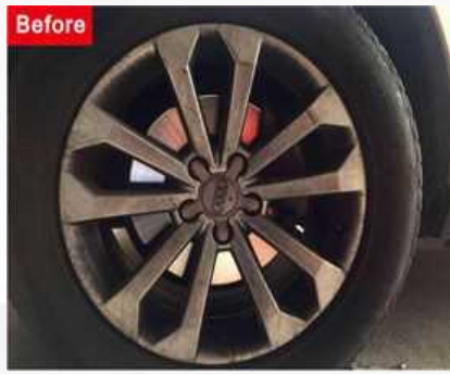
Filled with dust and mud