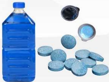
Effervescent Cleaning Tablets, All-season Windshield Washer Fluid