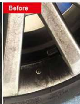
Wheel hub spokes are soiled at corners