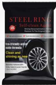
Rim, Tyre Cleaner Powder (500g/Bag),