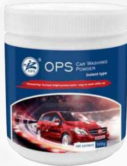
Touchless Car Wash Powder (500g/Bag), Touchless Car Wash Powder (500g/Box),