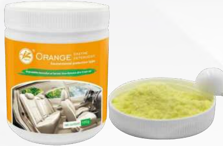
Orange enzyme detergent, cleaning car interior (500g/Box),