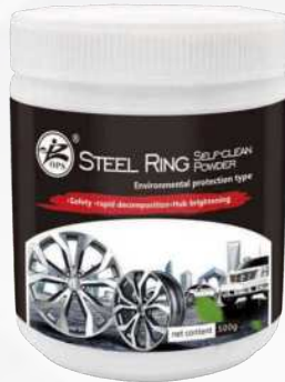
Rim, Tyre Cleaner Powder (500g/Box),