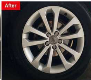
Clean and shining as new