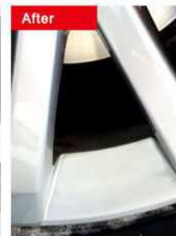
The corners are as clean as new