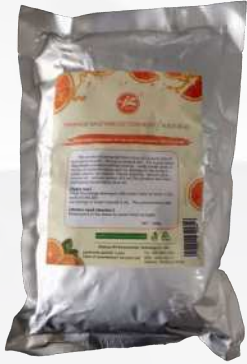
Orange enzyme detergent, cleaning car interior (500g/Bag),